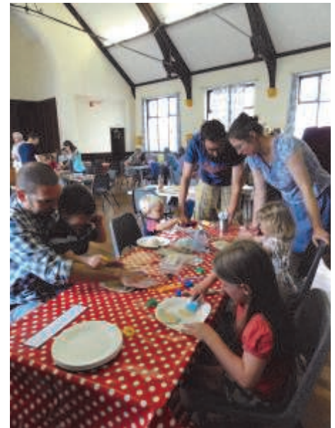
Action at June's all-age activity service in the Jarman Hall

Children learn about Jesus and other Bible stories in creative ways involving art, craft and games. At the end of June, we held our first experimental "Messy Church" service where all ages in the church family were encouraged to participate in a variety of interactive options. The next Messy Church will be held on Sunday 30 th November.