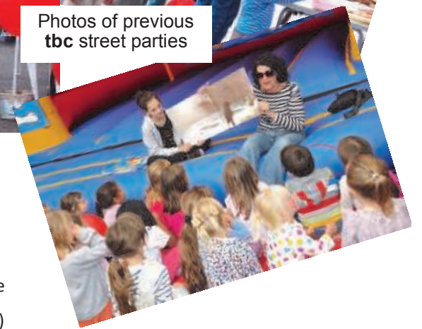
Photos of previous tbc street parties

Continental breakfast with hot drinks, toys and newspapers will be available. To book your free place, please contact us. (details overleaf)