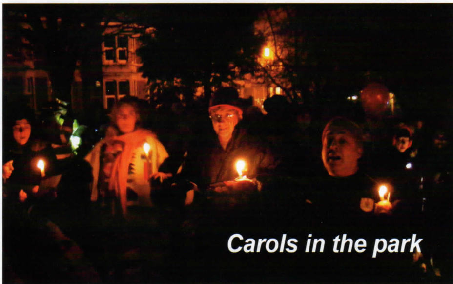
Carols in the park

Her solo performances range through a great variety of music, including old ballads upon which she has placed her own stamp, blues and gospel songs, hard-driving fiddle tunes, and one of her trademarks – fiddle-backed songs. Check out www.saltcellarfolk.blogspot.com